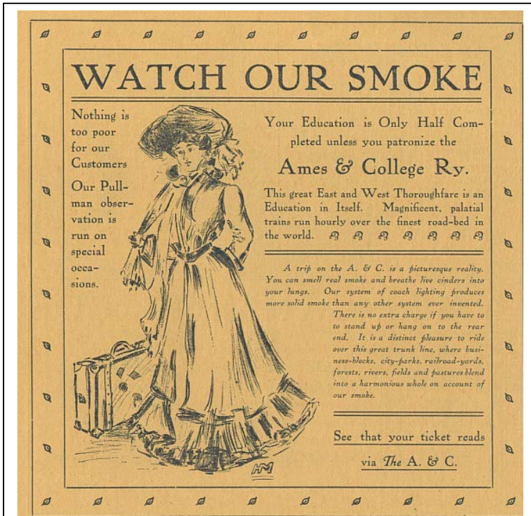
This satirical faux advertisement, from the 1906 ISC yearbook, The Bomb, is a good example of how the student community viewed the train by that time. Many of the frustrations the students felt about the Dinkey, including smoke, cinders, and overcrowding, are satirized in the ad.

increasing layers of abuse as community members vented their collective frustrations on the little train. Faux advertisements for the Dinkey and even an obituary for the little train graced the yearbook's pages in the railroad's final year. For many people in the college and the city, the Dinkey, with its negative press, fading reputation, and dangerous operating conditions, had become a symbol for what was wrong with the community rather than what was right. Again and again, contemporaries offered up pleas to upgrade the service on the Motor Line "in the name of progress and common sense." 60