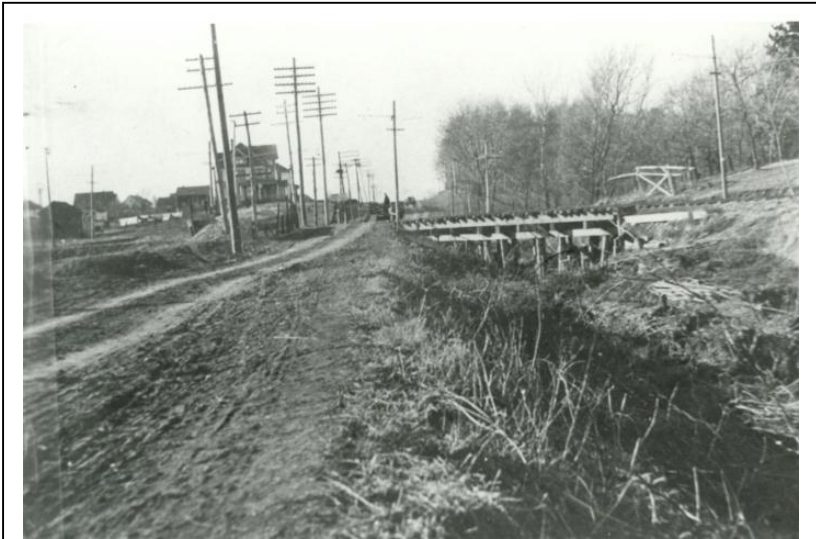
Boone Street (now Lincoln Way) was the transportation corridor between Ames and Iowa State College for decades before the Motor Line was built in 1891. In this picture of the muddy and poor road conditions, taken after electricity was installed in parts of western Ames in 1910, it is easy to see why the Dinkey became so popular with contemporaries. The buildings on the left are some of the poorly constructed boardinghouses that appeared from about 1898 onwards to serve college students. The ISC campus is to the right of the picture. The railway and bridge in the foreground belonged to the Fort Dodge, Des Moines & Southern Railway.

Throughout the 1890s Ames citizens and ISC students loved to ride what they called the Dinkey, with all of its attendant excitement, and they saw the “fussy, stuffy, little motor” as their “pet Motor Line.” 6 The little train was almost universally described as “the pride of the community.” 7 Yet, by the final months