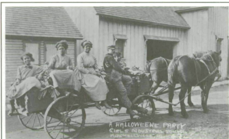
Four of the ninety black girls brought to the Girls Reform School of Iowa during the nineteenth century.

As their employment record indicates, most of the girls came from the rural state's few urban areas. Sixty-nine percent of the school's inmates came from counties with urban centers, even though in 1885, for example, counties with urban centers—towns and cities with a population of 2,500 or more—accounted for only 55 percent of Iowa's total population. Demographics best explain this phenomenon. Blacks and immigrants, who made up about half of the inmate population, tended to dwell in urban centers, where their concentration made them more noticeable to the native-born white population. 18