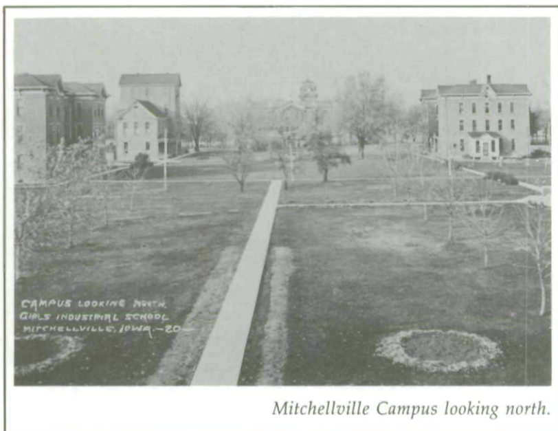
Mitchellville Campus looking north.

rived at the school, Lewelling placed her in one of two grades or classes according to academic ability. Group one went to the classroom following breakfast each weekday, while group two went to domestic science classes. Then after lunch the two groups exchanged places. 28