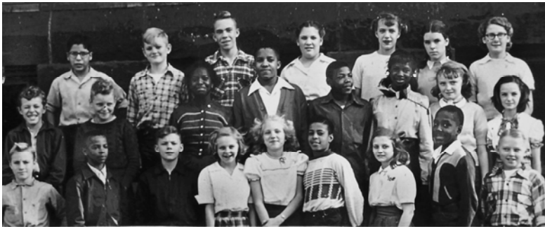
Students in an integrated classroom at Waterloo's Grant Elementary School pose for a class picture.

found in laboratory schools. 44 The central idea behind the creation of such schools was that districts could persuade—rather than force—white parents to send their children to desegregated schools. It was an effective idea. When Grant School opened in the fall of 1970, it had a nearly perfect fifty-fifty balance of African American and white children. The Bridgeway Project was able to draw white students to a school that in previous years had had almost none, although it also displaced half of the black children previously enrolled at Grant who had to transfer to other schools. With few other white students choosing to transfer to schools with high concentrations of black students, the burden of desegregation was placed on the shoulders of African American children, just as Harvey had predicted. 45