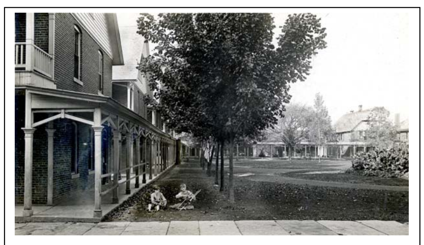
Two boys play in front of the boys' cottages at the Iowa Soldiers' Orphans' Home, probably in the 1920s or early 1930s.

In 1935, at the center of the ring of cottages, the ICWRS, with the help of state funding, built a preschool costing $7,280 (about $115,000 in today's dollars). For the next three years, the ICWRS tracked children grouped by age and IQ scores, monitoring the progress of those who attended the preschool and those who did not. All of the children had been at the orphanage for 18–21 months and ranged in age from 18 months to 5 years. The study was a small one of 46 children enrolled in the preschool and 44 whose daily routine remained unchanged.<sup>40</sup> The researchers remained skeptical of what the IQ test truly tested but used it nonetheless because it was the commonly accepted standard of the era. They expected the IQs of those attending the preschool to rise precipitously.