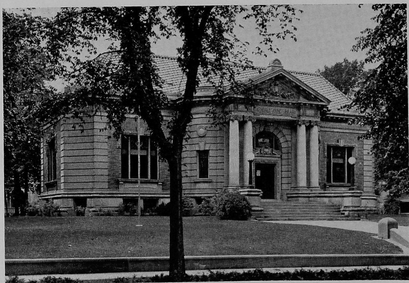
KENDALL YOUNG PUBLIC LIBRARY Webster City, Iowa