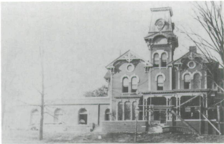
Hoyt Sherman Place. taken as the Des Moines Woman's Club was overseeing the renovation and expansion of the building.

many of his business contemporaries, never trusted any investment but real estate. His unwillingness to deal in stocks, bonds, and other dynamic but risky financial instruments made it almost impossible for him to build a genuine fortune or compete with the most aggressive business actors of the late nineteenth century.