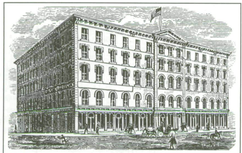
The Estes House during the Civil War, when the U.S. Army occupied it to use as a military hospital.

town's gas works stood "silent and gloomy" at the end of Main Street. Once busy streets were abandoned as businesses failed. In November 1859, the last merchant closed his doors on Keokuk's once bustling Second Street. "Alas, for Second Street." cried an editor. "Once so grand with its Athenaeum, its Bank, its Auction Stores, Bookstores and crowds of eager speculators! Now so deserted, so quiet!" In the center of town, the Estes House, which was to have been the Gate City's "grand hotel," sat unfinished, unfurnished, and unoccupied. A visiting reporter dubbed the roofless hotel "a monument of the folly to which even wise men will be led in a time of general prosperity." In a particularly emblematic move in the frigid December of 1858, the town, unable to pay the gas bill, had shut off Keokuk's street lamps. The lampposts would stand unused for years, looming in the darkness, spectral reminders of better times. 56