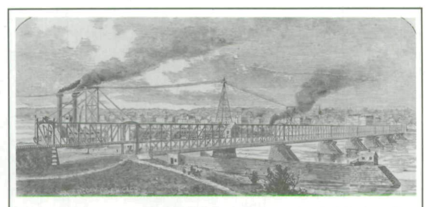
Sketch of the Rock Island Bridge.

giving stone piers. One of those boats, the Effie Afton, exploded, bursting into giant flames that set the bridge itself on fire. Embittered steamboat men mourned the loss of the Effie Afton, but toasted the flames that scorched the hated bridge. The bridge, of course, was quickly repaired.40