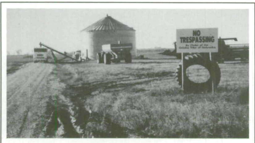
As Omaha farming operations proceed at Blackbird Bend, a sign in the foreground warns, "No Trespassing By Order of the Omaha Tribe of Nebraska." Photo, taken in October 1995, courtesy of the author.

On a more positive note, the struggle for Blackbird Bend represents one of the many steps taken by the Omaha tribe in the past few decades to "resurrect itself" as a vibrant and economically viable political and cultural entity. The courts' dismissal of most of the Omahas' claims as a punitive measure against the tribe's attorney casts an unsettling cloud on that determined effort. Nevertheless, the Omahas take a measure of satisfaction in knowing that a portion of the land they recovered in Iowa is now the site of the tribe's successful gaming operation, Casino Omaha. That enterprise, combined with the farming operations on the remainder of the land, has contributed significantly to the tribal revenue base over the past several years. They provide the most tangible legacy of the Omahas' "imperfect victory" at Blackbird Bend.