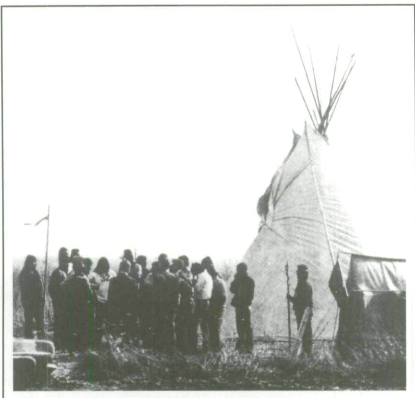
Omaha Indians occupying lands in the Blackbird Bend area explain their case to reporters.