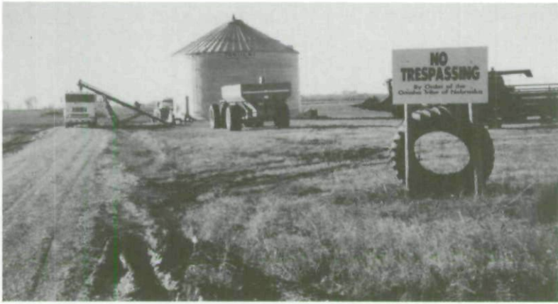
As Omaha farming operations proceed at Blackbird Bend, a sign in the foreground warns, "No Trespassing By Order of the Omaha Tribe of Nebraska." Photo, taken in October 1995, courtesy of the author.

On a more positive note, the struggle for Blackbird Bend represents one of the many steps taken by the Omaha tribe in the past few decades to "resurrect itself" as a vibrant and economically viable political and cultural entity. The courts' dismissal of most of the Omahas' claims as a punitive measure against the tribe's attorney casts an unsettling cloud on that determined effort. Nevertheless, the Omahas take a measure of satisfaction in knowing that a portion of the land they recovered in Iowa is now the site of the tribe's successful gaming operation, Casino Omaha. That enterprise, combined with the farming operations on the remainder of the land, has contributed significantly to the tribal revenue base over the past several years. They provide the most tangible legacy of the Omahas' "imperfect victory" at Blackbird Bend.