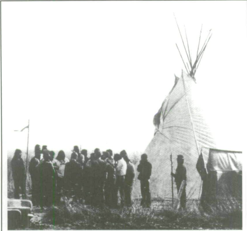
Omaha Indians occupying lands in the Blackbird Bend area explain their case to reporters.