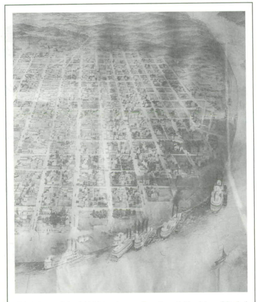
This lithograph by J. T. Palmatory renders the artist's vision of Keokuk in 1857. The 1853 Mormon encampment would have been located on the bluffs along the river just north of the developed portion of the city.

cerns: setting street grades to facilitate the population's movement to and from the "downtown," and regulating use of the wharf as a source of taxes to finance the necessary street work."